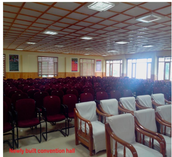
Newly built convention hall