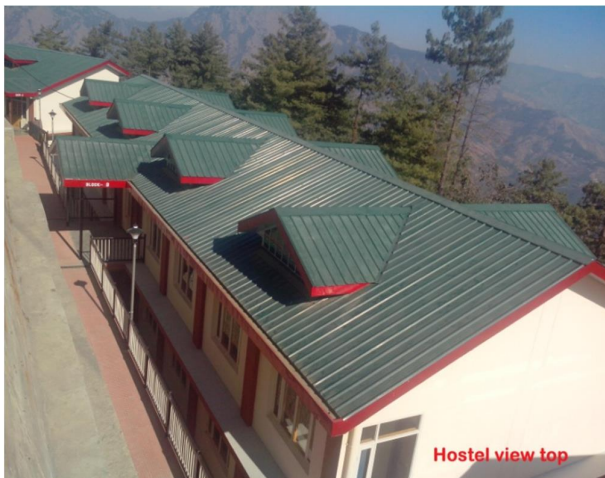
Hostel view top

construct one convention hall with a seating capacity of 250-300 persons with all facilities, like stage, audio-visual support etc. and mess in the same block with a seating capacity of 64 plus participants at a time. Two blocks of hostels with 30 rooms accommodating 60 participants at a time on twin sharing basis were also proposed. The work was started on 31-05-2010 and the construction work was assigned to H.P. Tourism Development Corporation. The actual expenditure incurred on the construction of Convention hall and hostel was ₹504.96 lakh and after completion in the year 2013-14, the infrastructure developed has been put into use on regular basis.