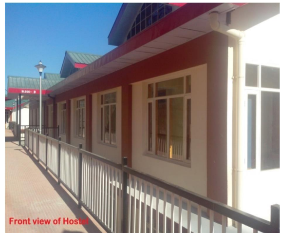
Front view of Hostel